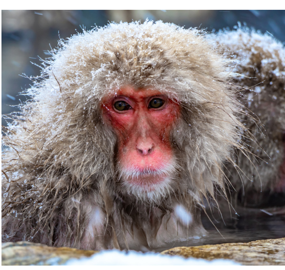
Snow Monkey, Yudanaka