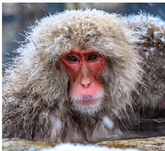
Snow Monkey, Yudanaka