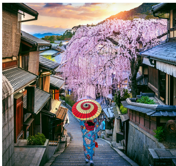
Streets in Kyoto

Located in a mountainous region that was cut off from the rest of the world for a long period of time, these villages with their Gassho-style houses subsisted on the cultivation of mulberry trees and the rearing of silkworms. On this tour we will see the fascinating houses with their steeply pitched thatched roofs, the only examples of their kind in Japan.