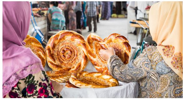
Traditional Uzbek bread

This morning is at leisure until our flight to Tashkent.