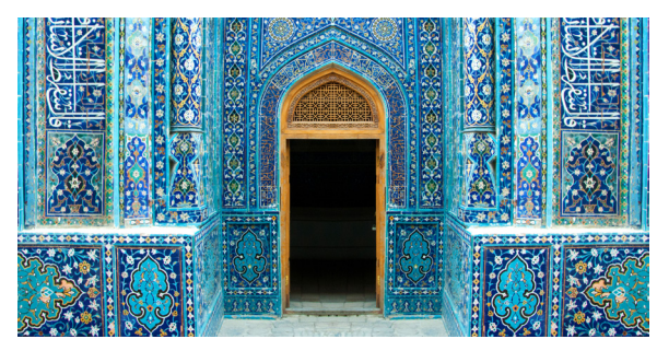
Shah-I-Zinda necropolis, Samarkand

Visit the beautiful, World Heritage fortress of Old Nisa, at the foot of the Kopet Dag Mountains, the earliest of the Parthian Empire capitals. Visit Arkadash stud farm, home of the famous