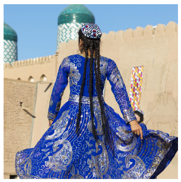
Traditional folk dancer in Khiva, Uzbekistan