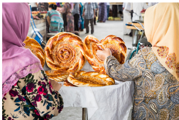
Traditional Uzbek bread

Full day exploration of the beautifully preserved, medieval town of Khiva. Wander the fabled Ichon-Qala (inner walled city) and visit the old citadel, the Emir's Palace, the magnificent Juma Mosque and the caravanserai.