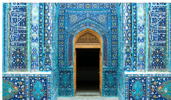
Shah-I-Zinda necropolis, Samarkand