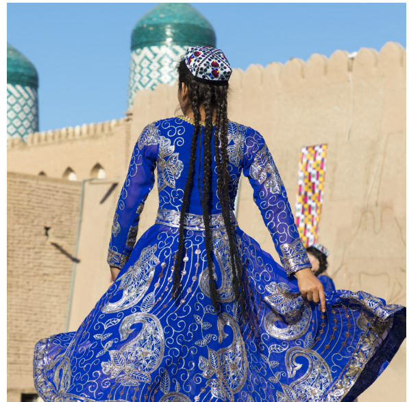
Traditional folk dancer in Khiva, Uzbekistan

Explore this remarkable town, its magnificent Juma mosque and caravanserai.