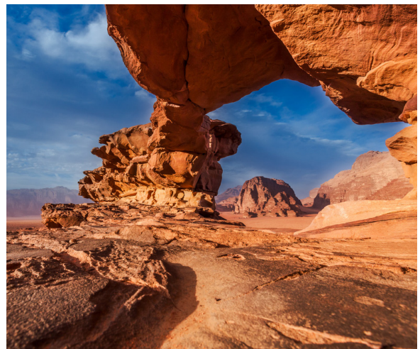
A rock arch in Wadi Rum, Jordan