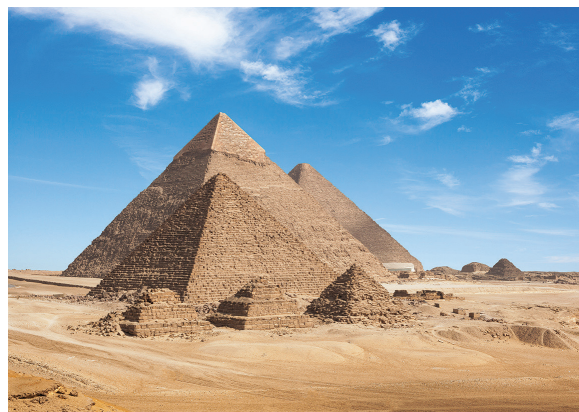
Pyramids of Giza

A full day to explore the Pyramids and Sphinx at Giza followed by the ancient capital of Memphis and the step pyramid and tombs at Sakkara.