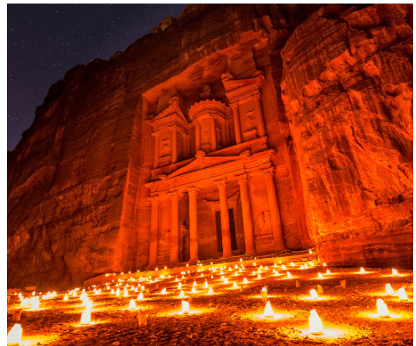
The Treasury, Petra

Overlooking Luxor temple, this winter retreat for the Egyptian royal family is the epitome of faded, luxurious glamour. Be sure to explore the extensive gardens, sip a cocktail as you watch life alongside the Nile, or take afternoon tea in one of the majestic reception rooms.