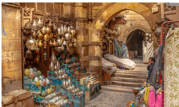
Khan el Khalili bazaar, Cairo

Drive to Amman and check in to our hotel.