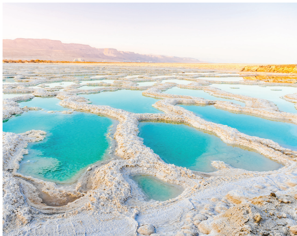
The Dead Sea

Fly from Auckland to Dubai, travelling overnight.